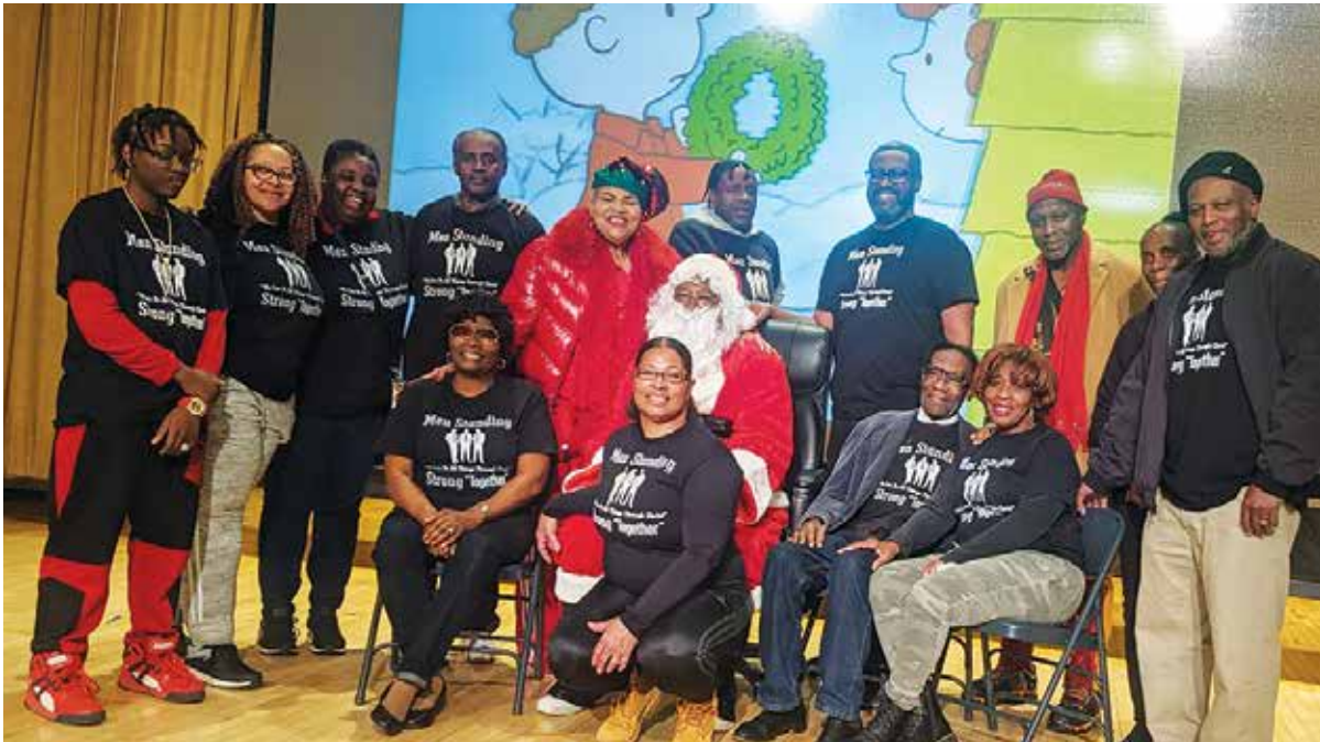
Members of MSST after a successful “A Charlie Brown Christmas” movie night at Abate on Dec. 15, 2024